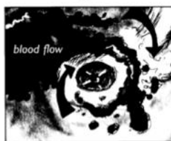
5 (CU) plug - hole!