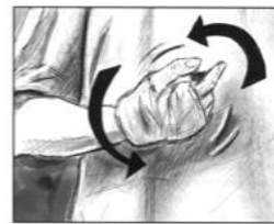
7 (CU) mirror image. Clench fist.