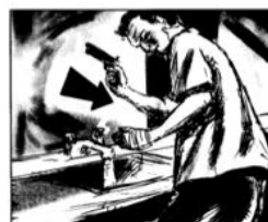
10 (MS) man tucks gun into belt...