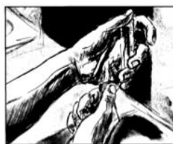
6 (CU) "bandage - wrapping"