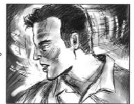
8 (CU) head turns / blurs quickly (right to left) R-L (Low back-lit) SFX: door opening