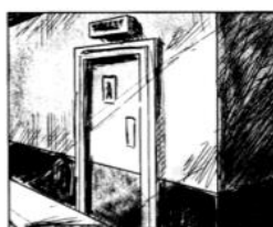
1 Est. wide shot (WS) low angle. zoom in - med. shot (Low key lighting)