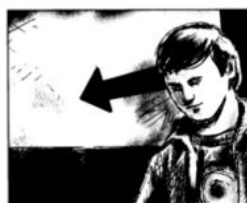
9 (MS) Boy enters room R-L