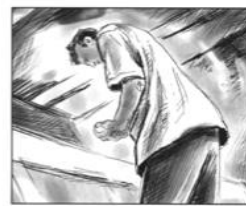
3 Low angle (MS)