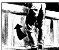
2 Int. low angle (MS) Slow tilt up to 3...